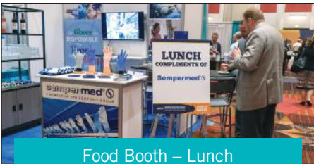
Food Booth – Lunch on the Show Floor